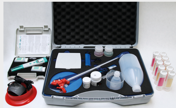
Test kit RSS titration measurement

For detailed information and a comprehensive consultation please get in touch with your direct contact at Rösler or send an E-mail to info@rosler.com .