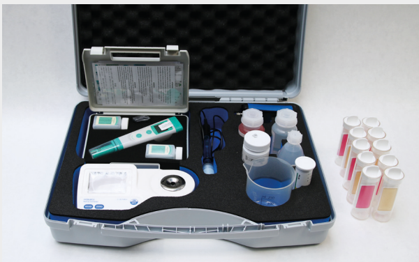
Test kit RSS refractometric measurement

We offer two test kits , each utilizing a different system for measuring the compound concentration.